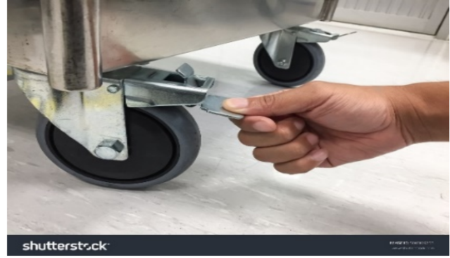
Lockable castor wheels — brake locks on all 4 wheels for stable operation