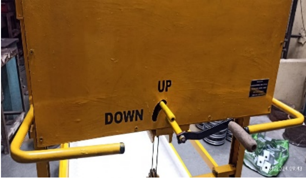
UP / DOWN safety locking lever — must be set to UP before raising platform